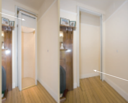
The Duo in the downstairs position