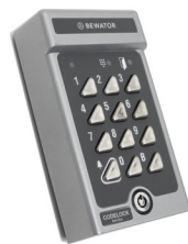
Numerical code lock