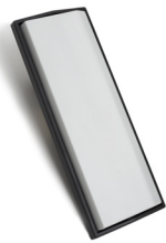
Externally fitted, elbow door call button